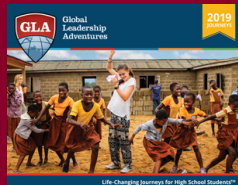
Leadership for Introverts